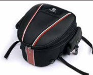
NUDA 900/NUDA 900R COD.8000H7788

► Kit borse laterali rigide Hard bags lateral kit