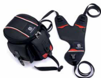
NUDA 900/NUDA 900R COD.8000H7785