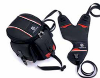
NUDA 900/NUDA 900R COD.8000H7785

► Borsa morbida superiore/posteriore Rear upper soft bag