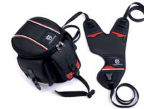
NUDA 900/NUDA 900R COD. 8000H7785

► Kit borse laterali rigide Hard bags lateral kit