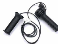
NUDA 900/NUDA 900R COD.8000H7822