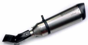
NUDA 900/NUDA 900R COD.8000H789