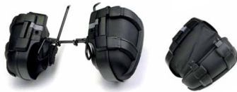
NUDA 900/NUDA 900R COD. 8000H7802

► Kit parabrezza alto High windshield kit