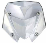
NUDA 900/NUDA 900R COD. 8000H7852