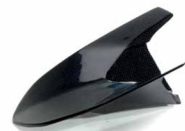
NUDA 900/NUDA 900R COD.8000H7674