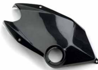
NUDA 900/NUDA 900R COD.8000H7673

► Parabrezza anteriore in carbonio Front carbon fairing