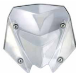
NUDA 900/NUDA 900R COD.8000H7852