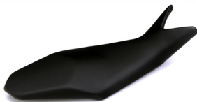
NUDA 900/NUDA 900R COD.8000H7809