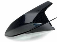
NUDA 900/NUDA 900R COD.8000H7674

► Coperchio AIRBOX in carbonio Carbon AIRBOX cover