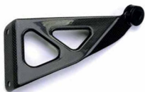
NUDA 900/NUDA 900R COD.8000H7792