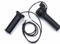
NUDA 900/NUDA 900R COD. 8000H7822