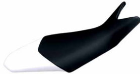
NUDA 900/NUDA 900R COD.8000H7793