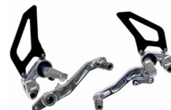
NUDA 900/NUDA 900R COD.8000H7853

► Kit scarico completo in titanio Titanium carbon muffler kit